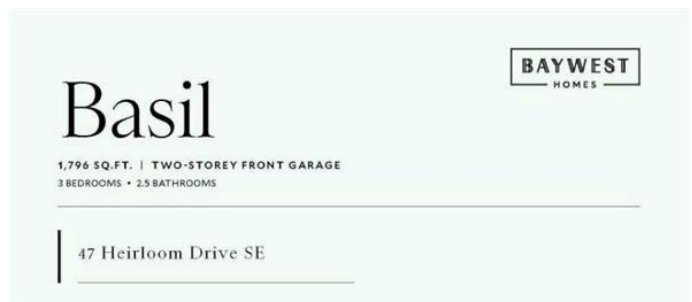
Main Floor 796 SQ.FT.