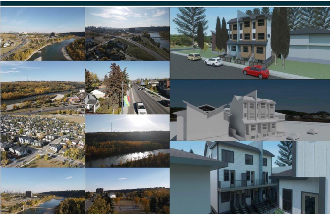
THE PLOT OF LAND : VISUALIZING YOUR NEXT PROJECT HERE

Seize this remarkable chance to acquire a prime MU-1 50 X 120 lot and bring your vision to life with the construction of the following Mixed-use building- a multi-story structure with commercial spaces on the ground floor and residential units above, creating a lively street atmosphere while addressing housing needs. Consider developing a series of townhouses or row houses, offering affordable options for families and individuals in a mixed-use setting. Live-work units- Design innovative spaces that blend residential living with commercial functions, perfect for professionals looking to operate a business from home. Small Retail or Office Space- Construct a boutique retail or office space to support local businesses, caf  s, or professional services, enhancing the community's economic landscape. Explore the possibility of creating facilities for community services, such as a daycare, community center, or health service center, that would greatly benefit local residents. Montgomery is a thriving neighborhood with an array of amenities just a short walk away, including shopping at Market Mall, a diverse selection of restaurants, and the scenic Bowness Park along the Bow River. Additionally, you  ll have quick access  whether by transit or vehicle  to the majestic Rocky Mountains, Canada Olympic Park, Winsport, the University of Calgary, and both the Children  s and Foothills Hospitals. The area is experiencing a surge of new families and positive growth.