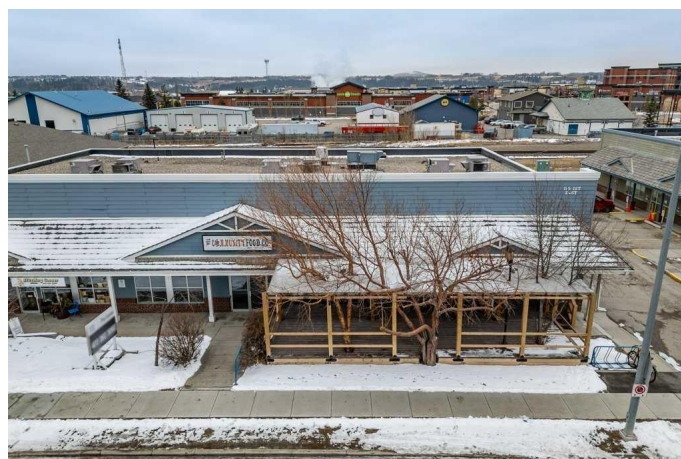
185 1 St E, Cochrane, AB

Main Floor Exterior Area 4639.87 sq ft Interior Area 4485.18 sq ft