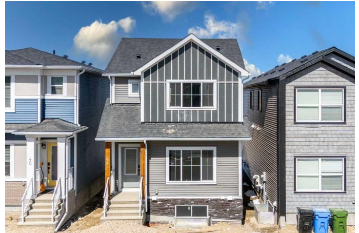
44 Lewiston Dr NE, Calgary, AB

Welcome to Your Dream Home- Presenting an exceptional opportunity to own a brand new, two-story home in the sought-after community of Lewisburg. Designed for modern living, this stunning residence seamlessly blends elegance, functionality, and comfort. Upon entering, youâ€™ll be greeted by an abundance of natural light and an open-concept layout that effortlessly connects the inviting family room, illuminated living room, and stylish kitchen. Luxury vinyl plank flooring flows throughout the main level, offering both durability and timeless appeal. This home surpasses standard builder specifications with premium upgrades, including sleek cabinetry, elegant interior doors, designer light fixtures, and sophisticated quartz countertops in the kitchen and bathrooms. Every detail has been carefully curated for refined living. Upstairs, discover three generously sized bedrooms, each offering comfort and charm. The primary suite is a true retreat, featuring a spacious layout, a double vanity, and a separate shower. The unfinished basement presents a versatile space with a separate exterior entrance and a bathroom rough-in- ideal for future development as a legal suite. Your vision can easily come to life. Step outside to the backyard with a large deck, perfect for entertaining or relaxing. Located near the parks, pathways, and recreational facilities, with access to schools, child care, and future educational developments. Schedule Your