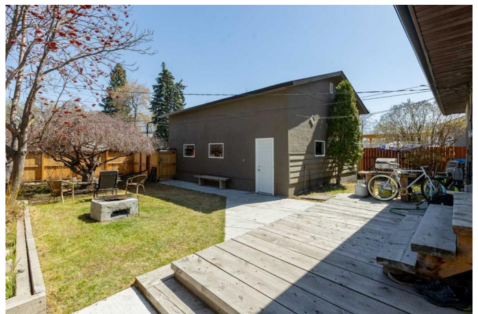
7032 22a St SE, Calgary, AB