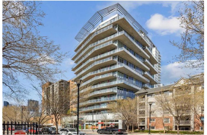
506 624 8 Ave SE - 04/17/2025 Main - 648.16 sq.ft/ 60.21 m2 RMS Area - 648.16 sq.ft/ 60.21 m2